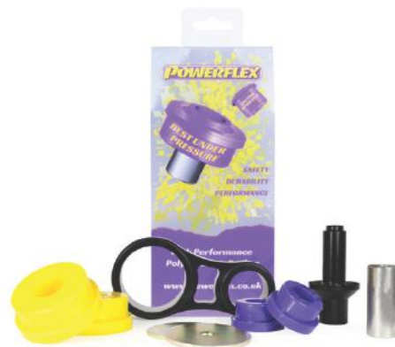
Figure 1- 19-2020 Polyurethane Parts A and B fitted into the bracket