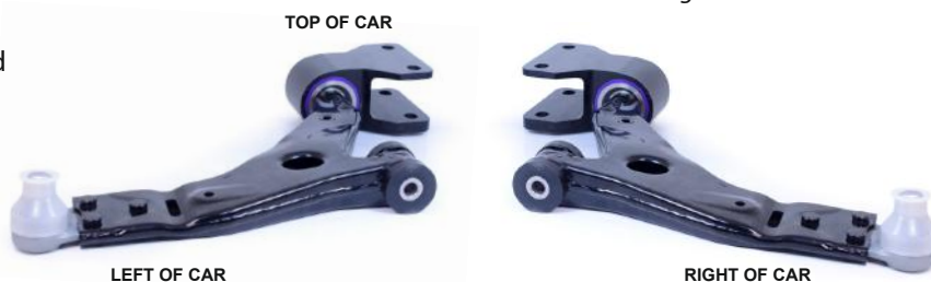
Figure 4 - Right-hand and left-hand bush and bracket assembly