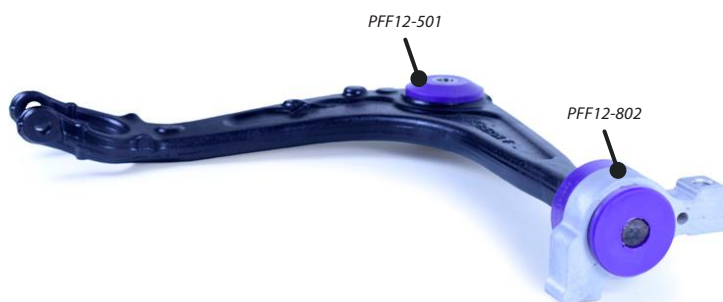
Figure 2 - fitted image showing PFF12-802 and PFF12-501