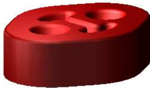
AUXILIARY VIEW (1 : 1)